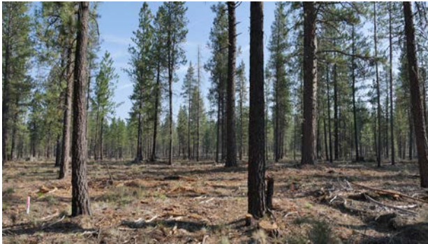
View from street - left side