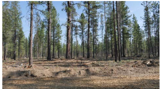
View from street - center