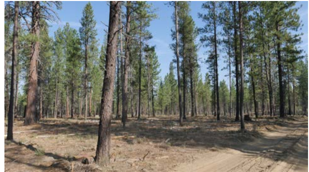
View from street - right side

The features, amenities, maps, and illustrations described and depicted herein are conceptual renderings based upon current development plans, which are subject to change without notice. Actual development may not be as currently proposed or depicted herein. All content, including prices and availability, is for information purposes only and is subject to change without prior notice.