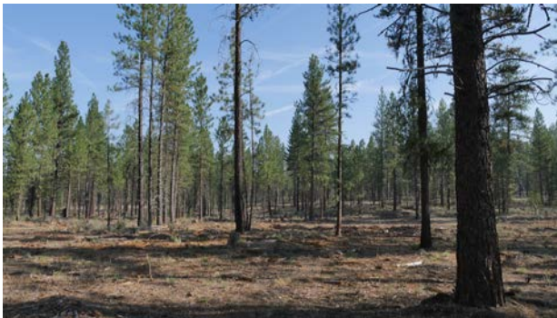
View from back patio