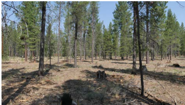
View from back patio