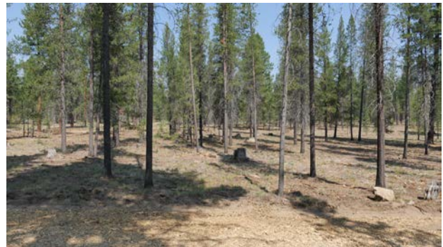
View from street - center