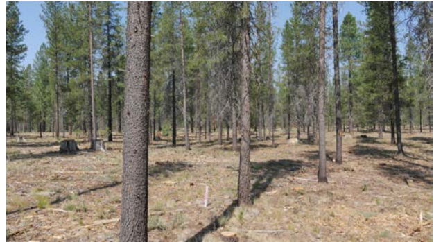
View from street - right side

The features, amenities, maps, and illustrations described and depicted herein are conceptual renderings based upon current development plans, which are subject to change without notice. Actual development may not be as currently proposed or depicted herein. All content, including prices and availability, is for information purposes only and is subject to change without prior notice.