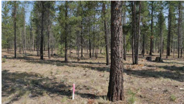
View from street - left side