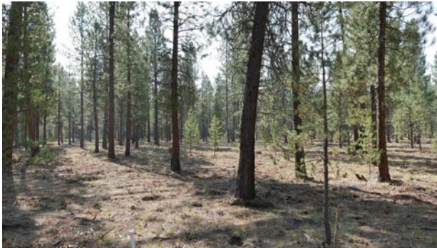
View from street - left side