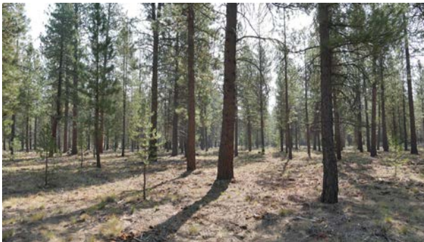
View from back patio