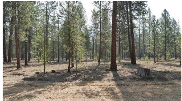
View from street - center