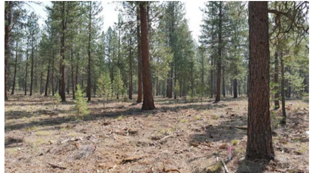
View from street - right side

The features, amenities, maps, and illustrations described and depicted herein are conceptual renderings based upon current development plans, which are subject to change without notice. Actual development may not be as currently proposed or depicted herein. All content, including prices and availability, is for information purposes only and is subject to change without prior notice.