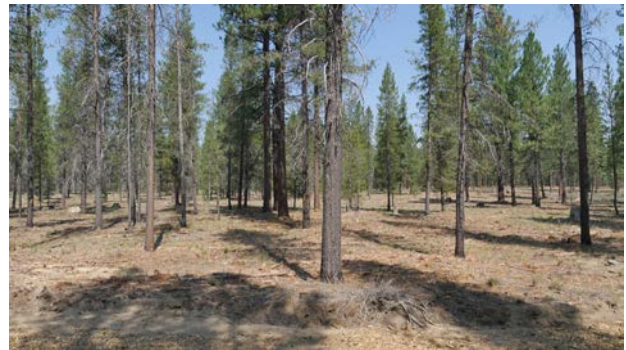
View from street - center