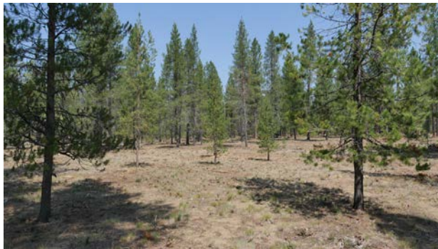
View from back patio