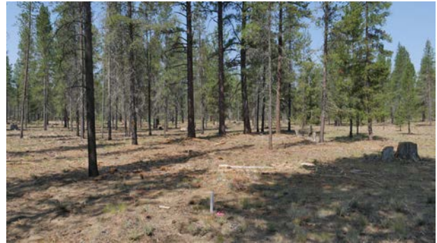
View from street - right side

The features, amenities, maps, and illustrations described and depicted herein are conceptual renderings based upon current development plans, which are subject to change without notice. Actual development may not be as currently proposed or depicted herein. All content, including prices and availability, is for information purposes only and is subject to change without prior notice.