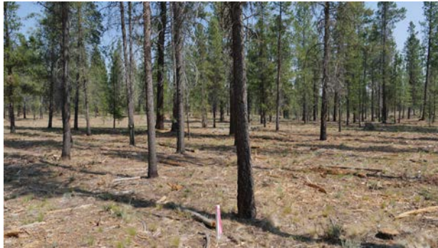
View from street - left side